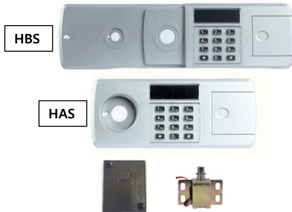
( HAS / HBS-T53 / Solenoid Lock )