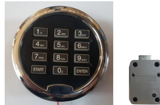
( AT-T200 / Motor Lock )

Material : ABS / Steel Cover Size : 33(H) x 56(W) x 46(D)mm 26(H) x 50(W) x 55(D)mm Weight : 195gr