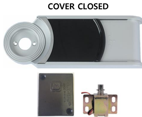
( KT-T53 / Solenoid Lock )