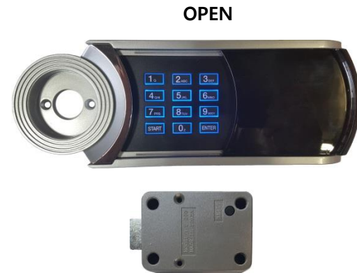
( KT-T200 / Motor Lock )