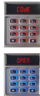
( Key Pad Part )

Material : ABS / Steel Cover Size : 33(H) X 56(W) X 46(D)mm 26(H) X 50(W) X 55(D)mm Weight : 195gr