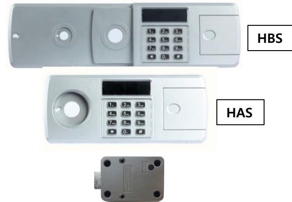
( HAS / HBS-T200 / Motor Lock )