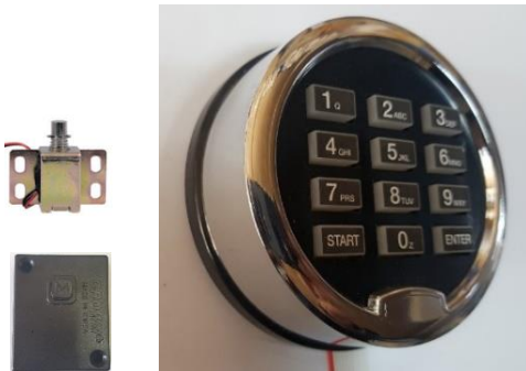
( AT-T53 / Solenoid Lock )

■ MODEL : AT-T53 / AT-T200 (Silver Color Case)